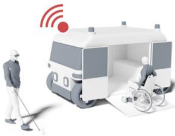
Accessibility and CAV

Connected and Automated Vehicles (CAVs) have the potential to improve public transport equity. Without the requirement of drivers and with more efficient energy consumption, CAVs are predicted