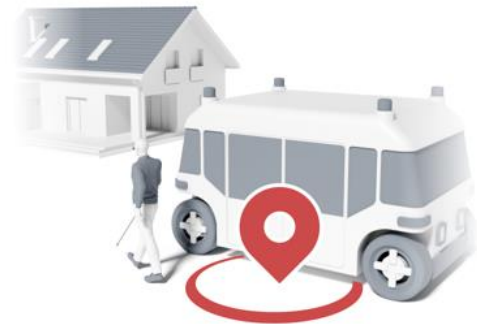
Drop-off Location and Final Destination

Upon leaving the vehicle, the journey does not end for a user, until they reach their final destination. This involves either finding their preferred building or location after departing or finding a connecting vehicle. This part of the journey involves navigating the drop-off location, which could be a transport hub or the kerb side. Many of these challenges are covered in chapter 2 which discusses the pickup location. As a result, this chapter explores the challenges unique to the drop off location.