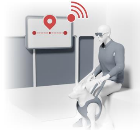
Trip Progress Information

Anticipating the time to exit the vehicle can be a major source of stress for people with disability. As CAVs will not have a human driver to alert passengers they are at their destination, automated vehicles will need to provide information about the trip progress. The implementation of navigation technology would allow users to track their location throughout their journey, as well as view any changes or disruptions to the journey.