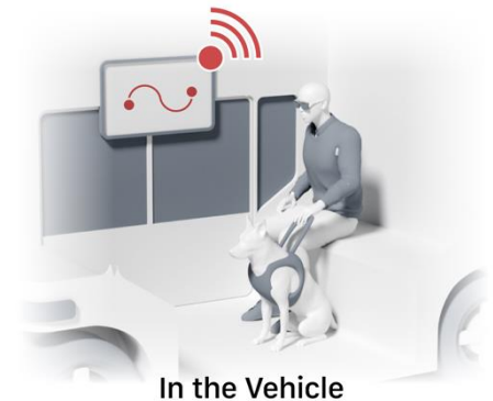
In the Vehicle

People with disability need to be able to navigate within the vehicle to find a comfortable place to sit or park their mobility device and stow their luggage. Each of these processes have their own challenges, ranging from restraining a wide variety of mobility devices with different requirements, to including spaces near accessible seating for an assistance animal. While some of these solutions exist within the public transport sector, implementing them within CAVs will be particularly important to compensate for the lack of a driver being available to provide assistance.